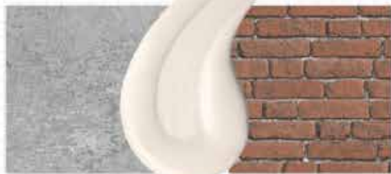
FROM LEFT Brixton ceramic floor tile in Mid Grey, £30 per sq m, Bathstore; Staked Lime absolute matt emulsion, £35 for 2.5l, Little Greene; and Paste the Wall brick-effect wallpaper, £12.72 per 10m roll, Colours at B&Q